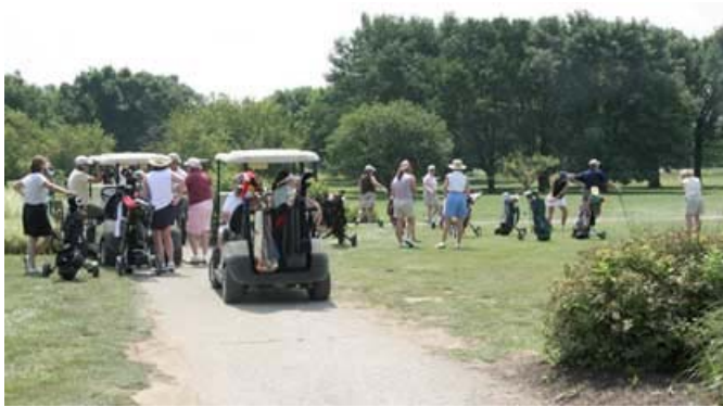
The field prepares to tee off in the First Annual TFT Benefit Outing at Reeves GC.